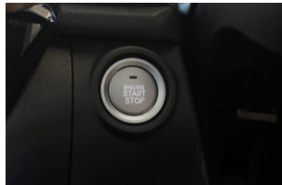
SMART KEYLESS ENTRY AND A PUSH START BUTTON.