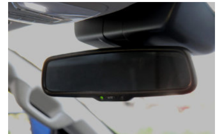
AUTO-DIMMING MIRROR & DASHCAM POWER OUTLET.