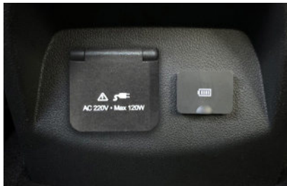
220V POWER OUTLET.

The ACC automatically adjusts the vehicle speed to maintain a safe following distance.